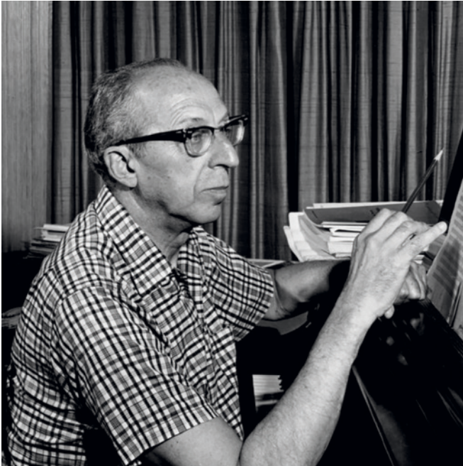
AARON COPLAND, 1962

listen carefully to the lower strings that open the symphony, you will hear their motto again throughout the course of the work.